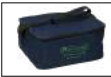
Convenient carry bag. Taşıma Çantalı