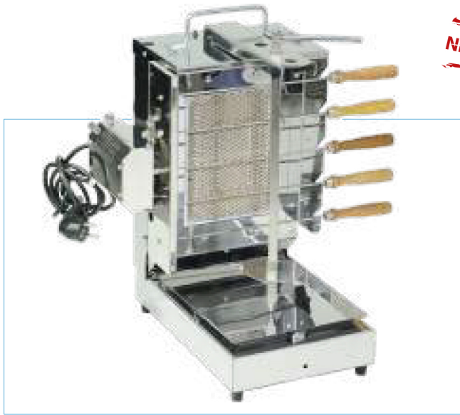
SB - 645

Mini Şiş - Döner Makinası ( Elektrik Motorlu 220 V ) Shawarma - Shashlik Grill ( Elektrik Rotisserie Motor 220 V )