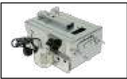
Convenient carry bag. Taşıma Çantalı