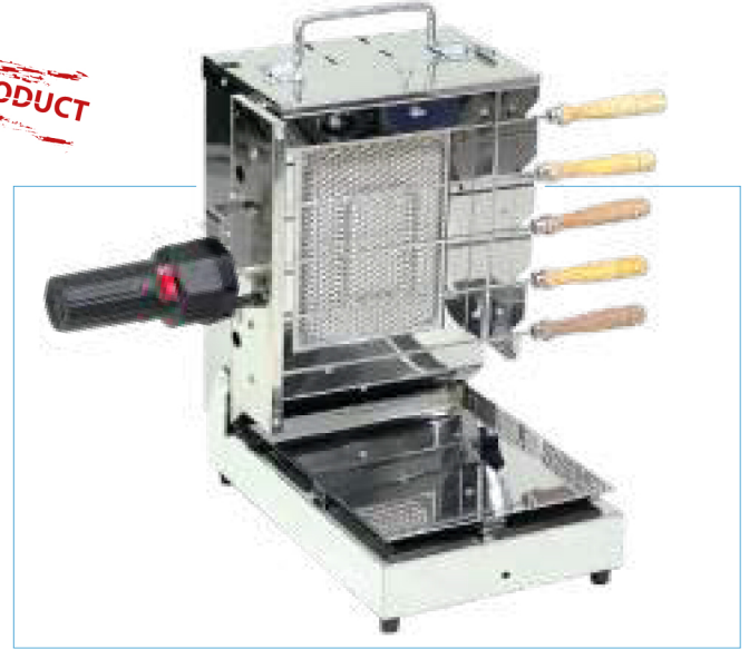
SB - 645

Mini Şiş - Döner Makinası ( Pili Motorlu ) Shawarma - Shashlik Grill ( Pili Rotisserie Motor )